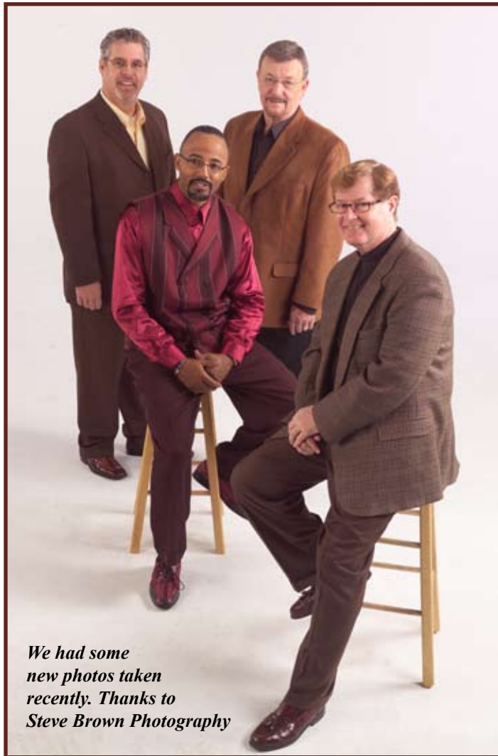
We had some new photos taken recently.